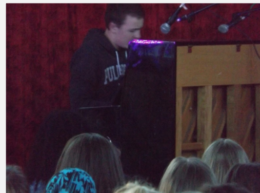
Tucker O' en- Someone you (Adele)